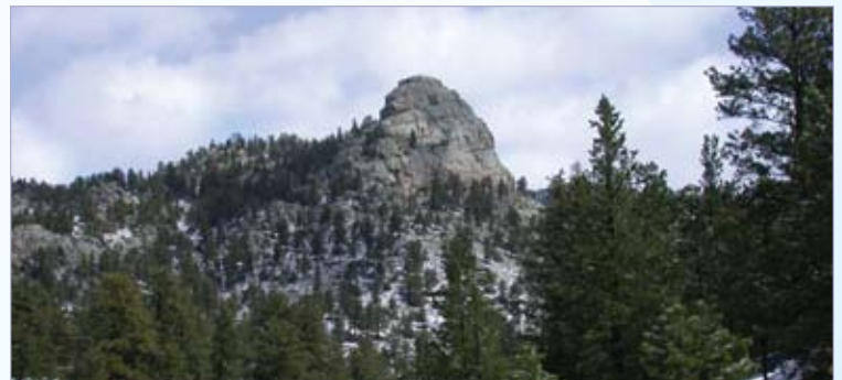
A scene after a light spring snow in Estes Park, Colorado.