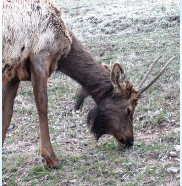
Elk eating new spring grass in Estes Park, Colorado

Eventually we found ourselves talking about intuition, that quiet voice that lives in our tummies or in our hearts, and has the answer to any question we have. We'd be in the car